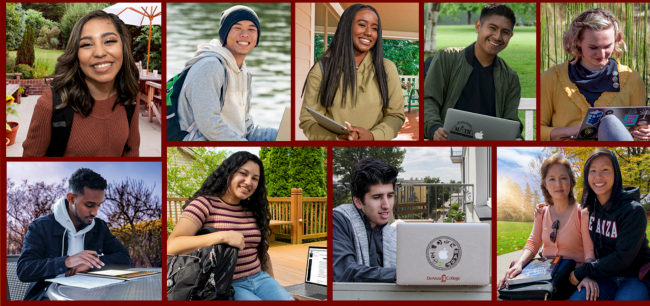
STRATEGIC PLANNING WORKSHOP #3 Regional Trends, Enrollment and Retention Feb. 28, 2022