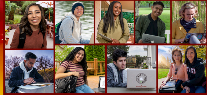
STRATEGIC PLANNING WORKSHOP #4 Ensuring Learning Through the Student Success Factors March 14, 2022